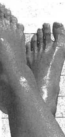
*Recommended to be used twice daily

■ Surgery In some cases you can choose surgery to remove the nail, but remember: this is NOT effective treatment for nail fungus unless it is backed up with extra therapy.